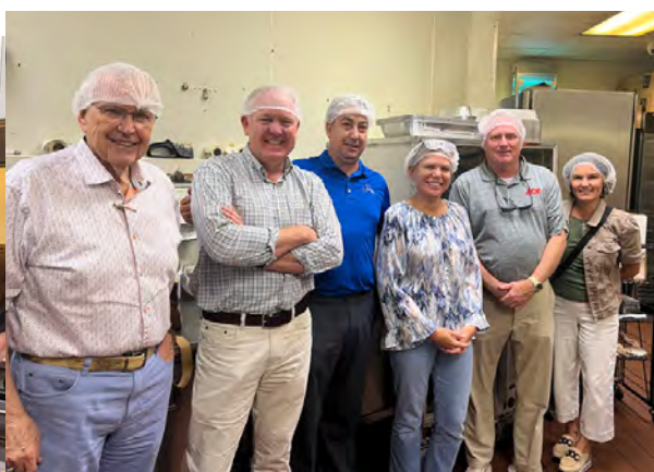
The Chicken Coupe taste testing crew!